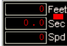
Mudpond Runway Test Gauge

The Mudpond Runway Test Gauge is designed to find the length of the takeoff run, the elapsed time and the airspeed.